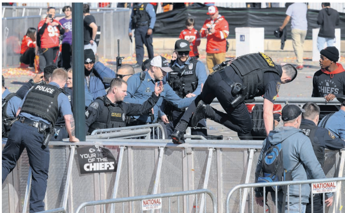
Law enforcement personnel clear the area around Union Station following a shooting at the Kansas City Chiefs NFL football Super Bowl celebration in Kansas City, Mo., Wednesday, Feb. 14, 2024.